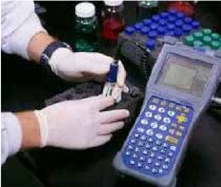
Figure 3 - Testing for the remaining useful life of a wind turbine gearbox oil

The RULER ® is the instrument used to quantitatively determine the remaining useful life of the lubricant by measuring the remaining concentration of antioxidants. The speed at which the antioxidants deplete over time is monitored and then used to predict appropriate oil change intervals as well as identify abnormal equipment conditions before machine failure occurs. The established limit value for wind turbine gearbox oils is 25% of the oil's initial value.