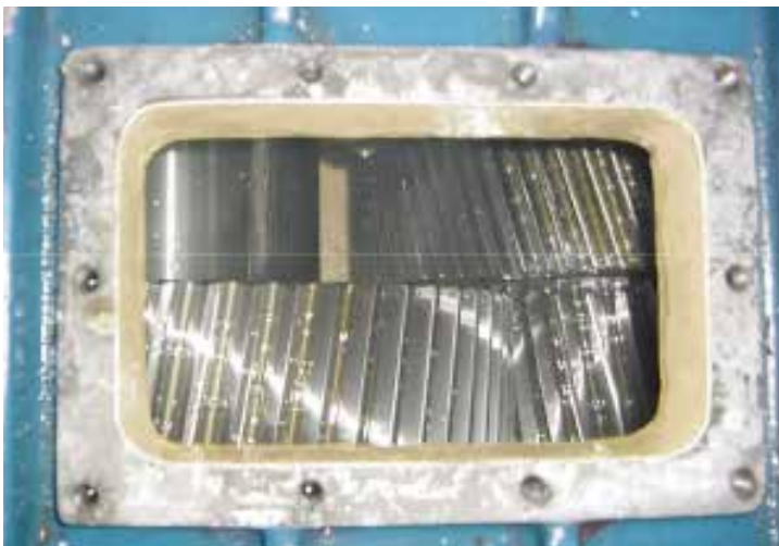
Figure 2 - Presence of foam in wind turbine gearbox

Foaming may be the result of a mechanical problem caused by excessive agitation or a low level of oil. If foaming occurs but disappears quickly when the machine stops, we must also consider the condition of the oil and the possible ineffectiveness or depletion of anti-foaming additives.