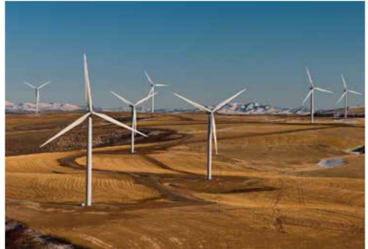
Figure 1 - Typical wind turbine environment